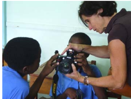
Documentation of the patients before and after surgery . Patients enjoy to check out their pictures.